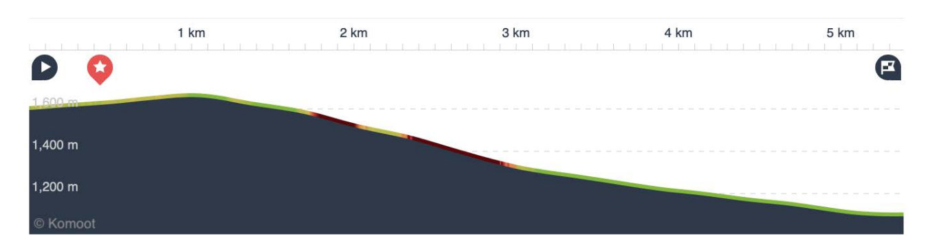
Day 2 - Mt. Asahidake to Mt. Kurodake Distance - 12.5 km / 7.8 miles Ascent - 1080 m / 3543 ft

Distance - 5.2 km / 3.2 miles Ascent - 70 m / 230 ft